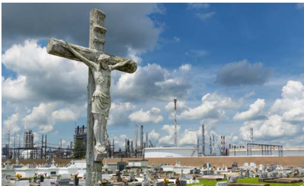
View of the Holy Rosary Cemetery in Taft, Louisiana, with a petrochemical plant on the background. The cemetery is located in the so called 'Cancer Alley'.

In addition to targeting marginalized communities, the multi-faceted petrochemical industry emits excessive quantities of greenhouse gases causing an acceleration of the global climate crisis.