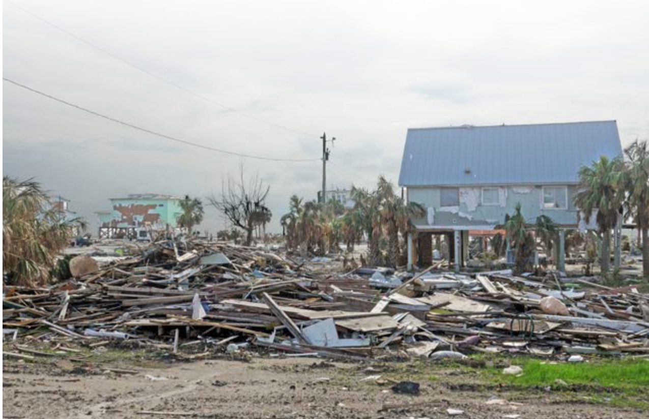
Debris and Destroyed Buildings on Gulf Coast in the Aftermath of Hurricane Michael.

By 2030, the number of flood events in the region will double, putting nearly 2 million homes at risk in just Florida and Texas alone.(24) Louisiana is experiencing one of the highest relative levels of land loss to sea level rise on the planet.(25) The acceleration of land loss is due to a deadly combination of oil and gas operations and engineered federal controls over the natural flow of the Mississippi River. Gulf Coast communities are significantly disadvantaged in preventing and recovering from flooding as a result of social and economic inequalities. The most impacted areas are host to long-standing tribal territories and historic Black communities.